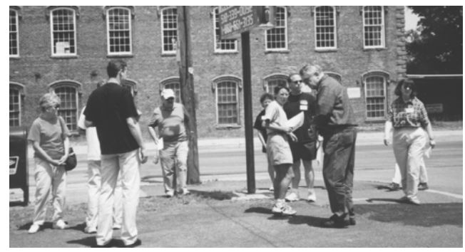
A tour group gathers at the base of Vliet Street near the old Harmony Mills Office, across from Harmony Mill #3.

The day was graced with ideal weather, and recent rains brought the falls to their spectacular best. Tour participants ended the afternoon at the Visitor's Center with refreshments, which included the now-famous SCHS mastodon cookies.