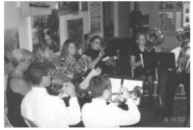
The Cohoes High School brass ensemble provided music during the evening.