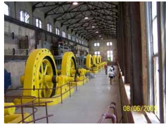
A view inside the plant, with its long hall and row of seven generators, which convert the waterpower produced by water flowing through turbines into electricity. Four of the generators are currently in operation; the rest will be brought on line shortly.

Future plans for the site include creation of a Visitor Center to host students and other groups, and further restoration of the buildings and grounds to more closely approach the original appearance of the facility.