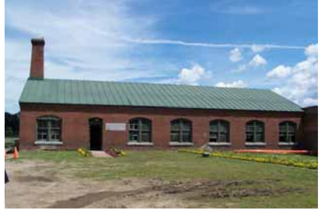
The Mechanicville Hydroelectric Station

The morning's tour of Harmony Mill #3 covered the building from the turbine room in the basement to the roof and upper floors with their awesome views of the Mohawk River, Cohoes Falls, and Rensselaer County hills. This was a chance to see firsthand the progress in restoring and adapting this landmark industrial structure for residential use.