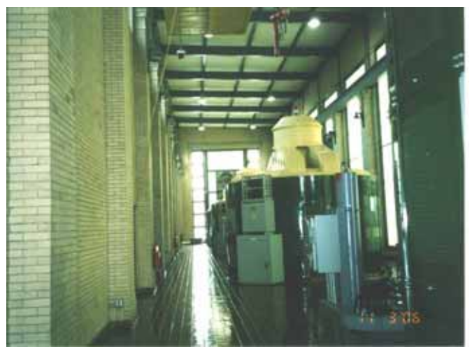
A view down the generator hall. The hydroelectric turbines are located underneath each generator, about 20 feet below the floor.

Ford was convinced by his close associate Thomas Edison (the foremost proponent of direct current) that DC was preferable for running his auto factory so the plant was originally designed to generate direct current; it was later converted to alternating current. The plant, still generating power today, has four turbines, each spinning at 80 revolutions per minute and generating about 1,500 kilowatts of electricity. At the time they were installed, the vertical propeller turbines in the hydropower plant were the largest of their type in the world.