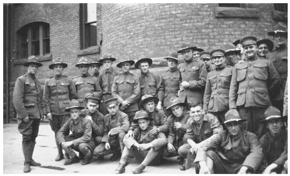
Soldiers pose in front of the Cohoes Armory in 1917, as the men prepare to fight in World War I. They distinguished themselves in battle, winning most of the honors given by the U.S. and receiving recognition from foreign governments as well.

The forerunner of Company B was organized on December 1, 1875 when a group of Cohoesiers gathered around a pot-bellied stove decided to form a National Guard unit. The group, eventually consisting of 100 members, was accepted in February 1876 as the Third Separate Company of the 10<sup>th</sup> Brigade and Third Division. The company was first called to duty in July 1877 during a railroad strike in Troy. In 1898 the unit became known as Company B of the Second Regiment and 109 men volunteered for service in the war against Spain. The declaration of war was on April 25, 1898 and Company B was called into service on May 20, 1898. Company B never saw action but was sent to Florida, and then to Cuba. The company suffered 32 casualties, primarily due to typhoid fever and other illnesses contracted in conditions of excessive heat with a lack of sanitary facilities. They returned home in late summer, arriving by train in Troy on August 27, 1898.