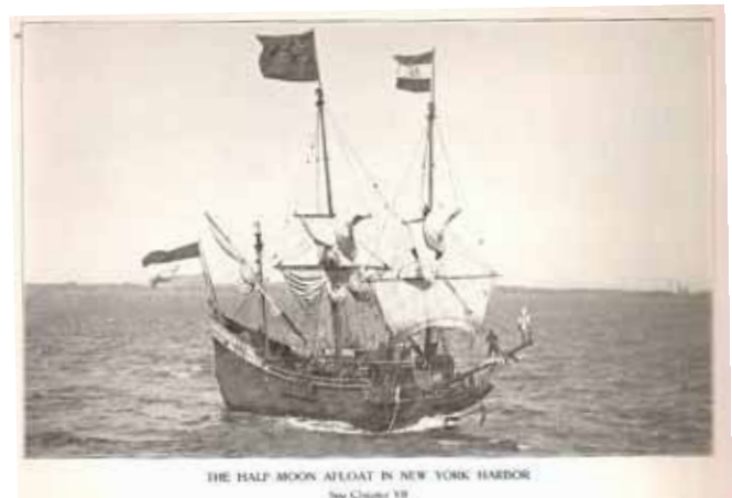
The Half Moon afloat in New York Harbor, 1909. From the Fourth Annual Report of the Hudson-Fulton Celebration Commission, 1910.