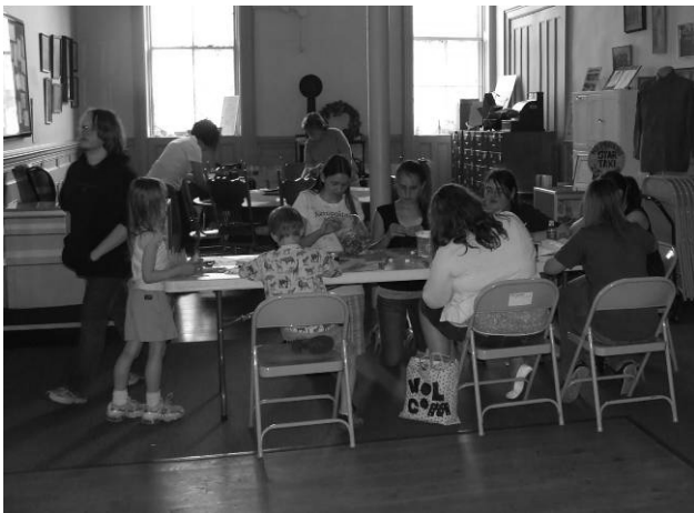
Students create origami pieces and other paper art during the reception.

From April 1 to May 9, SCHS hosted the sixth annual Cohoes High School Art show in the Cohoes Visitor's Center. The multi-media display included drawings, paintings, photographs, collage, and sculpture. SCHS held an after-school pizza party on April 23 for the student artists.