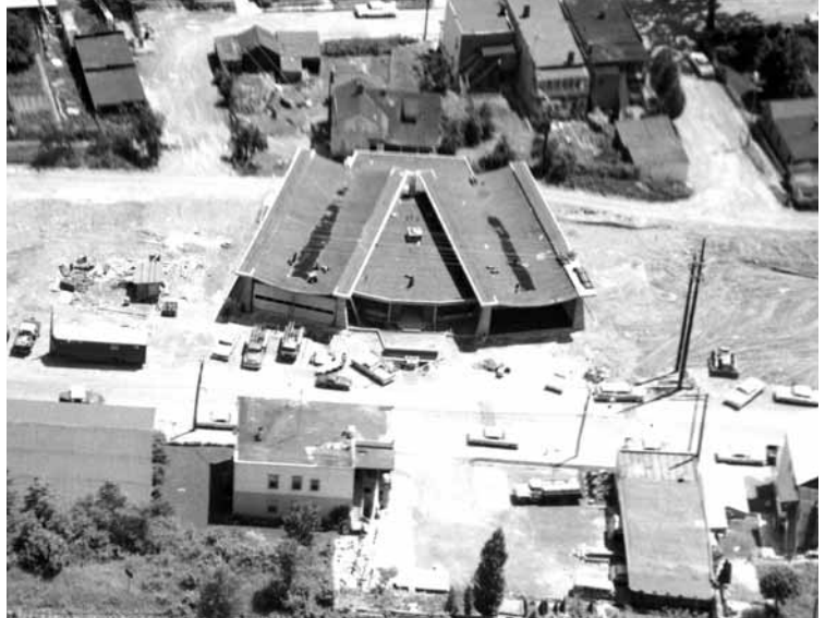
Construction of the Central Avenue Firehouse, June 1966.