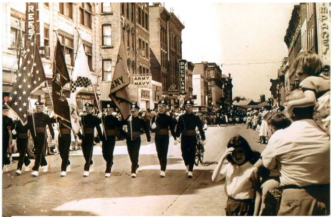
A 1953 photo of the Empire State Grenadiers on parade in Cohoes.

The Interstatesmen disbanded in 1967, but their years of outstanding performances and those of their predecessors will always be remembered.